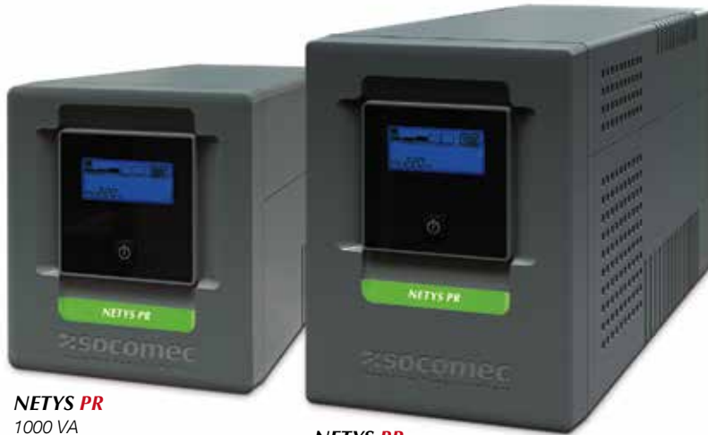
NETYS PR 1000 VA

Space saving reliable protection from 1000 to 2000 VA - Mini Tower