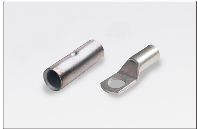
Copper Lug and Link Series.