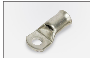
Bell Mouth Copper Lug Series