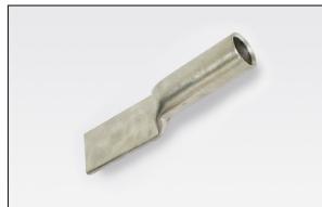
Long Barrel Long Palm Series