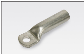
Long Barrel Short Palm Series